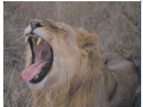
IUCN / Jim Thorsell

Action: produce and disseminate guidance and best practice to all parties on the importance of a gender perspective in the management of protected areas, focusing on: (i) an increased commitment to the recognition of women's knowledge of local ecosystems; (ii) acknowledging and enhancing women's roles in decision-making for natural resources management; and (iii) a special commitment to increase the capacity of poor women to engage as key stakeholders. Lead: WCPA/CEESP TILCEPA.