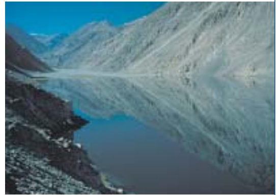
IUCN / Jim Thorsell