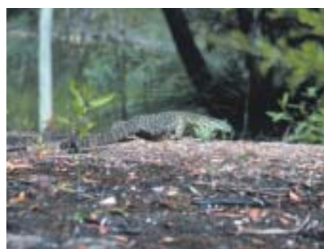
IUCN / Jim Thorsell

Action: compile and disseminate examples of effective and poor practice with regard to policies, incentives and regulation of activities affecting protected areas. Lead: WCPA Global Change Theme.