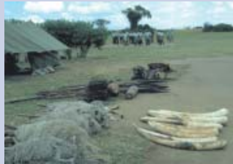
IUCN / Jim Thorsell